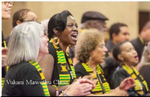
Vukani Mawethu Choir

The Church for the Fellowship of All Peoples